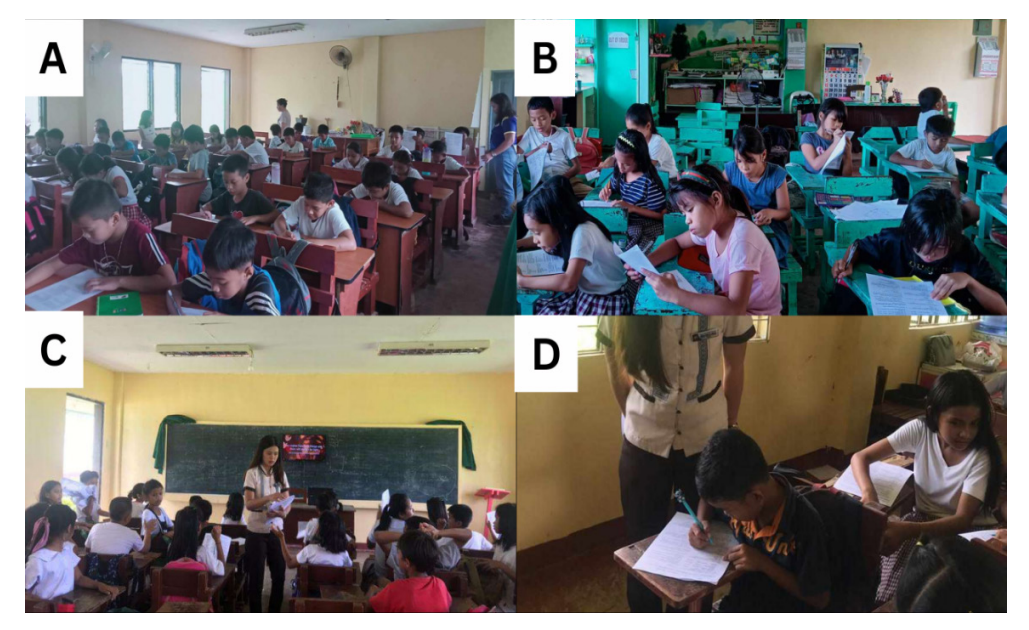
Figure 2. Conduct of Pilot Testing of the test-questions at Taytayan Integrated School (A); Conduct of pre-test for the control group (B); Conduct of pre-test for the experimental group (C); Conduct of post-test for the control group.

During the instructional phase,s the control group was taught problem-solving skills using traditional methods, while the experimental group received instruction using manipulatives designed to enhance their problem-solving abilities in various mathematical contexts. These manipulatives provided hands-on experiences that helped students better understand and apply problem-solving strategies. Following these instructional sessions, both groups were given post-tests to evaluate the effectiveness of the teaching methods and to determine whether the use of manipulatives had a positive impact on the students' ability to solve routine and non-routine problems.