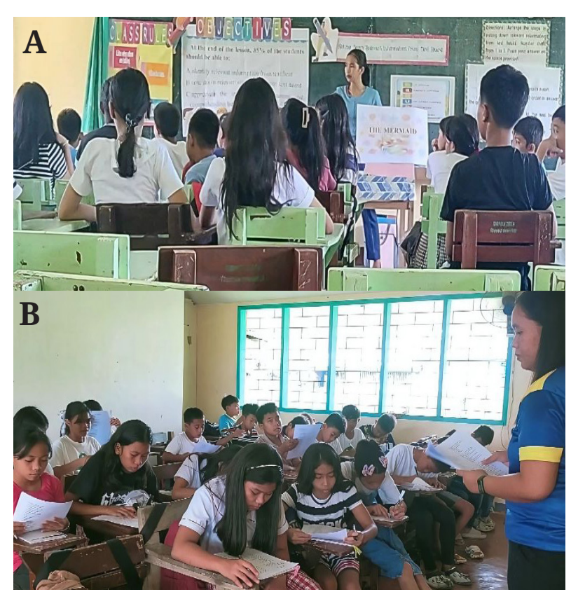
Figure 2. Photo documentation during data collection (A, B).